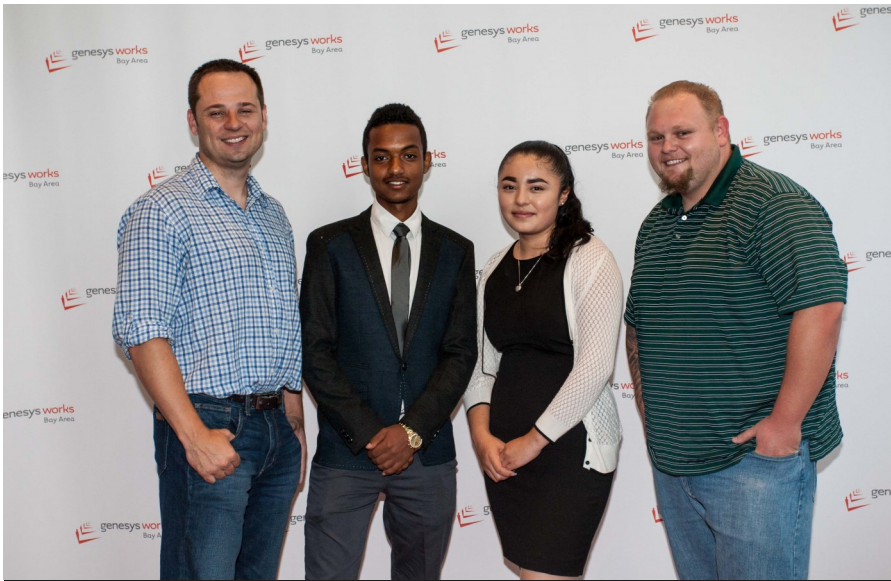
Salesforce Managers with their interns at Breaking Through